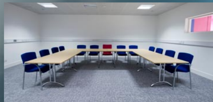
Fashion Studio - boardroom